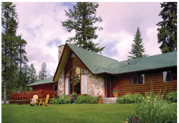
Stanley Thompson Cabin

The Milligan Manor is located on the first fairway of the golf course. Featuring eight bedrooms each with their own entrance and private bathroom, this cabin also offers a full kitchen, a large sitting room/dining room.